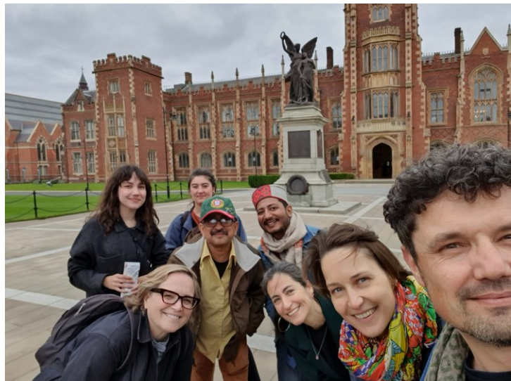
Photo 1 DePOT team members at Queen's University Belfast

This year, the DePOT Summer Institute took students and postdoctoral affiliates to Belfast in Northern Ireland, from 20 th – 22 nd June. We were hosted in The Graduate School at Queen's University, which opened as the Lynn Library building, part of Queen's College Belfast in 1868. The building is a vibrant hub of postgraduate activity, and it was the perfect location for this year's Summer Institute, packed with two days of exciting papers, posters, and panels.